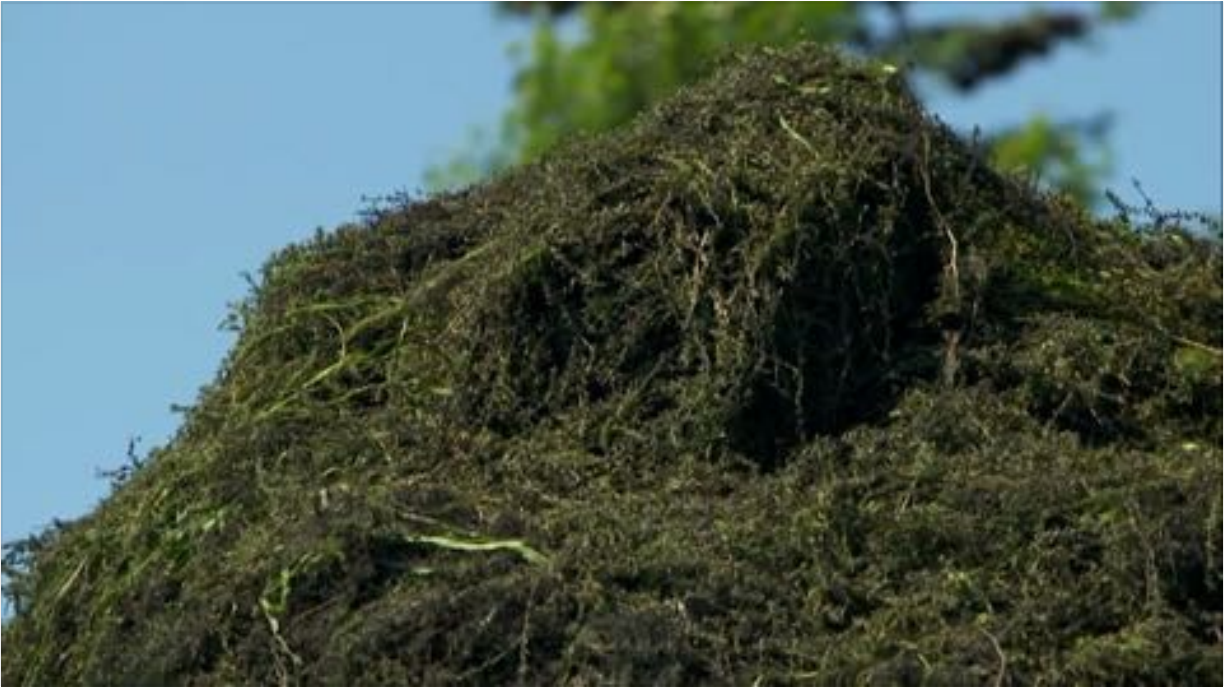
All water-milfoil fragments that are removed from bodies of water

Underwater, divers also combine jute sheeting operations with manual lifting and an underwater vacuum.