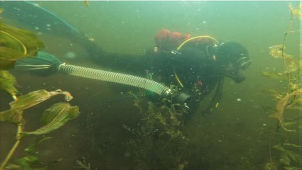
The divers will pull out the plants manually, but will use the aspiriophyll (underwater vacuum) to bring up the fragments.

Underwater, divers also combine jute sheeting operations with manual lifting and an underwater vacuum.