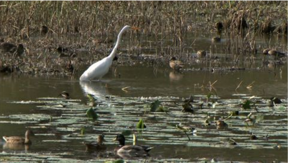
Biologist H el ene Godmaire suspects migratory birds of having transported fragments of Eurasian water-milfoil into Lake Hertel.