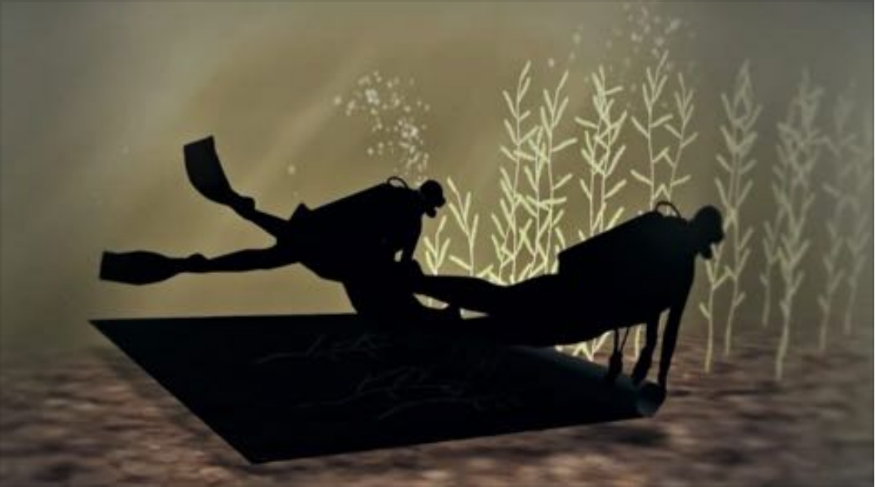
Two divers unroll a synthetic canvas at the bottom of a lake.